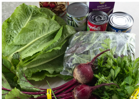
CRF delivery to Holocaust survivors with added non-perishables from Community Resource Center