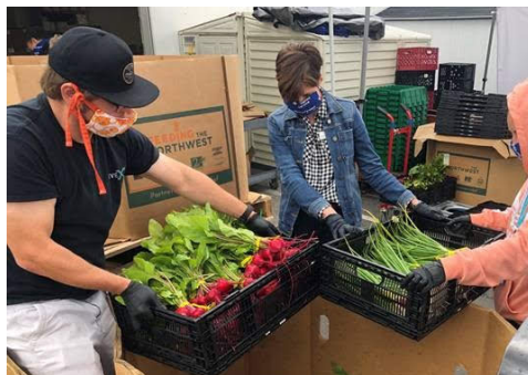
CRF donation for Jewish Family Service's no-touch drive-thru distribution

Additionally, our Education Team has begun providing online programming in order to continue offering equitable access to environmental education and Jewish learning to students, teachers, and families of all backgrounds.