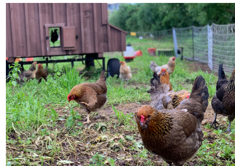
Educational Facebook Live "Your Morning Scramble" featuring chickens